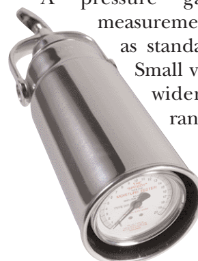
Standard Size Speedy

A pressure gauge with a moisture measurement range of 0 - 20% is fitted as standard to both the Large and Small vessels, but gauges with both wider and narrower moisture ranges are available.